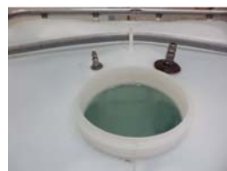
FIG. 3 Quick Connect Fitting Locations