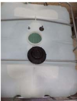
FIG. 5 Sample Fill Level and Preparation

8.2 After the container has been sealed (in accordance with the proper closing instructions) and as much air as possible has been removed from the test sample, start pressurizing.