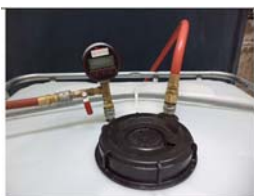
FIG. 4 Fitting and Closure Final Assembly

7.2.2.5 Fill the container as full as possible without the closure in place (see Fig. 5).