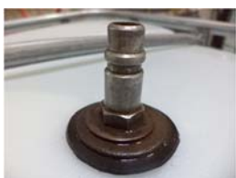
FIG. 2 Water Inlet Quick Connect Fitting

7.2.2.4 Connect the water supply line to the water inlet fitting (see Fig. 3 and Fig. 4).