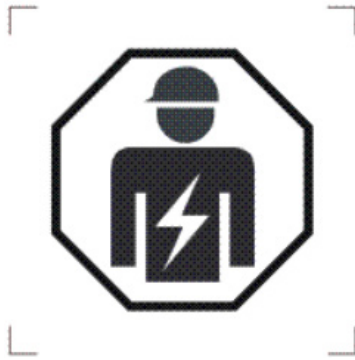
IEC 60417-6182 (2013-09)

EXAMPLE Following symbols can be used for “skilled person”.