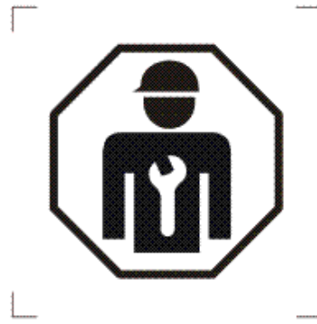
IEC 60417-6183 (2013-09)

Installation, electrotechnical expertise