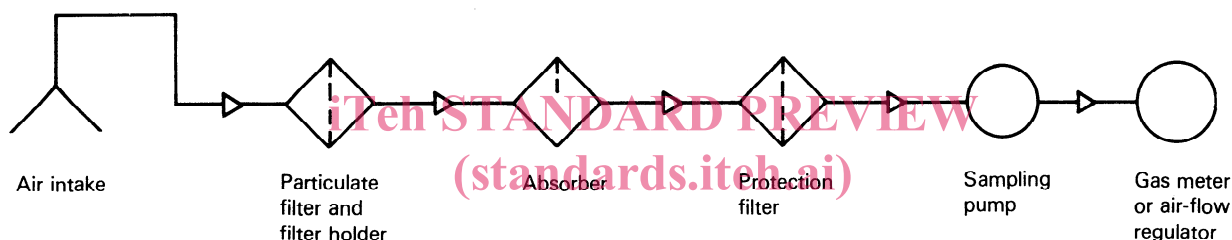
SIST ISO 4219:1995 https://standards.itech.ai/catalog/standards/sist/a6cefc7e-c2af-4639-a981- Figure 1 — Block diagram of sampling equipment

The internal diameter of the tubing shall be 6 to 8 mm and the internal surface shall be smooth.