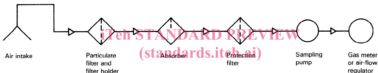
ISO 4219:1979 https://standards.itech.ai/catalog/standards/sist/b200af03-fbd5-49bb-bfc6-222222222222 Figure 1 — Block diagram of sampling equipment

A schematic layout of a typical assembly system is shown in figure 1 :