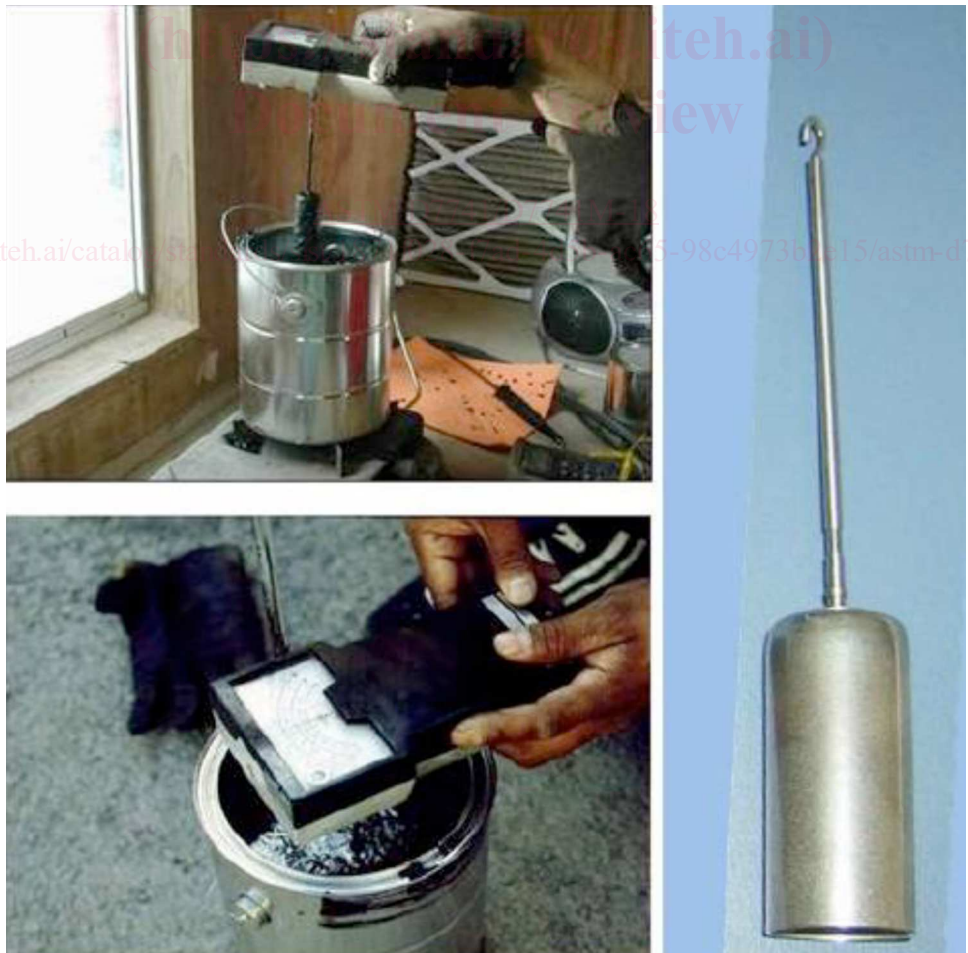
FIG. 1 Handheld Rotational-Type Viscometer