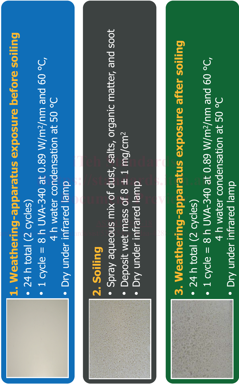
FIG. 2 Summary of the Simulated Field Exposure Method