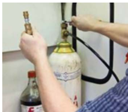
FIG. 6 Purging the Air from the Interior of the SO 2 Filling Hose

every 2 s. Allow the pressure in the RPV to increase to 14.7 ± 0.2 psi. Then rapidly close the valve on the tank and the RPV.