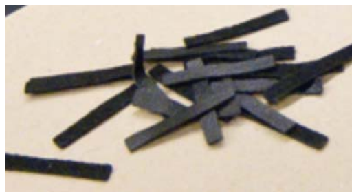
FIG. 1 Specimens for Aging Test

9.1.4 Using polytetrafluoroethylene (PTFE) tape sealant, prepare the valve head threads for assembly into the RPV. Make sure all old sealant is removed using a stainless steel brush before applying the PTFE tape. The PTFE tape is wrapped around the threads, several layers thick, depending on the thickness of the tape (see Fig. 2). Methods used should result in leak free joints (see section on leak checking).