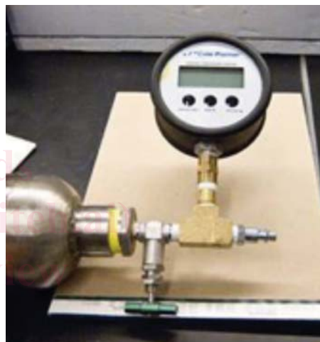
FIG. 5 Attaching the Pressure Gauge and Filling Port to the RPV