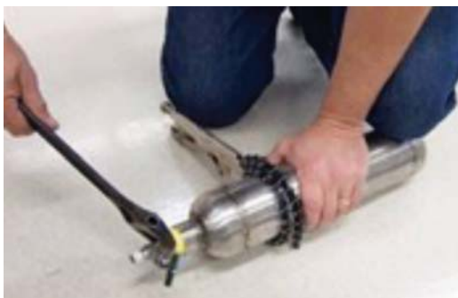
FIG. 3 Tightening of the Valve Head

9.2.4 Open the RPV valve completely (wide open) and slowly open the SO 2 tank valve to the point resulting in a pressure increase on the pressure gauge of approximately 1 psi