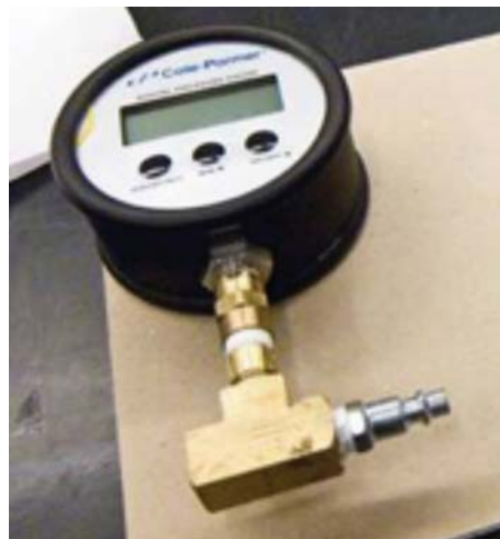
FIG. 4 The Pressure Gauge and Filling Port