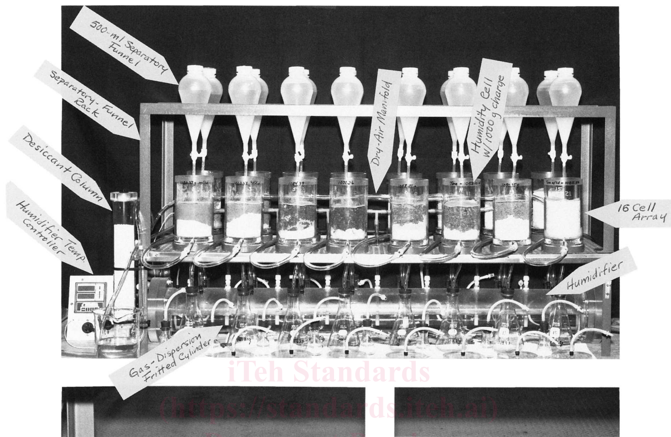
FIG. 2 Front View of 16-Cell Array (Option A) with Separatory Funnel Rack

10.2 Option B —The humidity cells are mounted on a rack of sufficient height to accommodate placement of vessels for collection of effluent from the bottom of each cell. The upper portion of the rack doubles as a separatory-funnel-separatory funnel rack, and is of sufficient height to accommodate placement of the funnel spigot above the humidity-cell-humidity cell lid. A simple rack of wood construction is shown in Fig. 4. Note that holes are drilled in the humidity-cell-humidity cell shelf to accommodate the barbed fitting (drain) that is centered at the bottom of each cell. Unlike the Option A apparatus, no air plumbing is required. Unlike Option A, Option B cells are stored in an enclosure in which temperature and humidity are controlled during the 6 days following the leach. Shelves for cell storage and space for temperature- and humidity-control equipment are required in the enclosure.