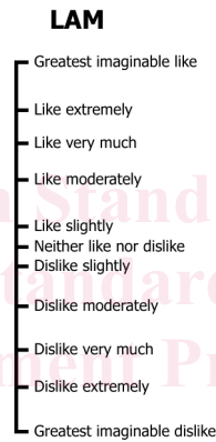
FIG. 1 Labeled Affective Magnitude Scale

labeled affective magnitude scale (LAM) , n —a type of labeled magnitude scale, with verbal labels related to liking and disliking. There is a neutral point in the center of the line scale and the opposing end anchors are “greatest imaginable like” and “greatest imaginable dislike.” See Fig. 1 . (2015)