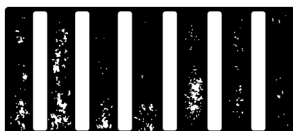
FIG. 3 Stroboscopic Lines Opening When Timer is Adjusted to Exactly 200 r/min