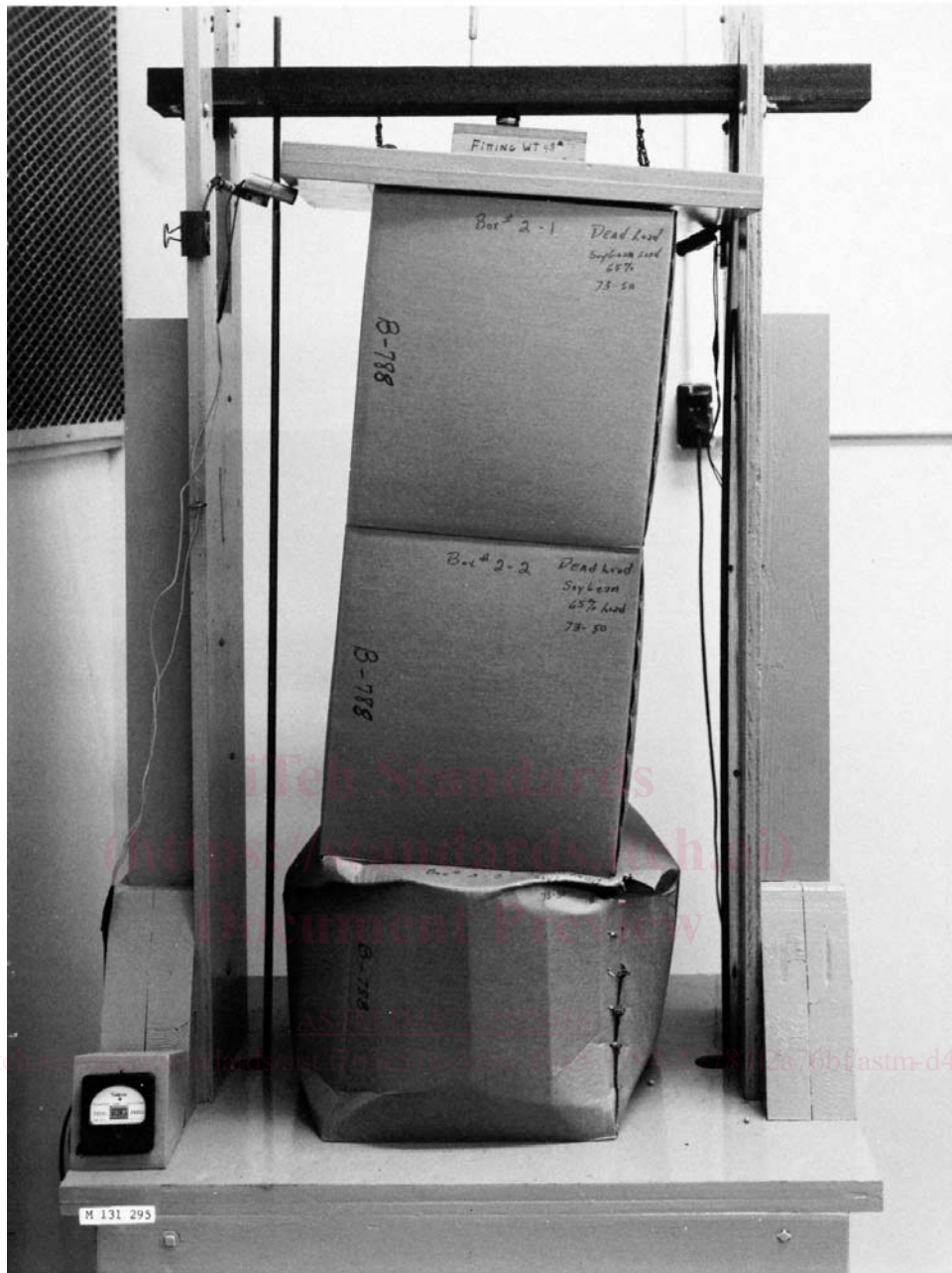
FIG. 1 Containers Under Constant Load of Dead Weights Imposed by Other Containers

deformation (inches or millimetres) while under load, or an autographic recording device that records load and deformation over a period of time.