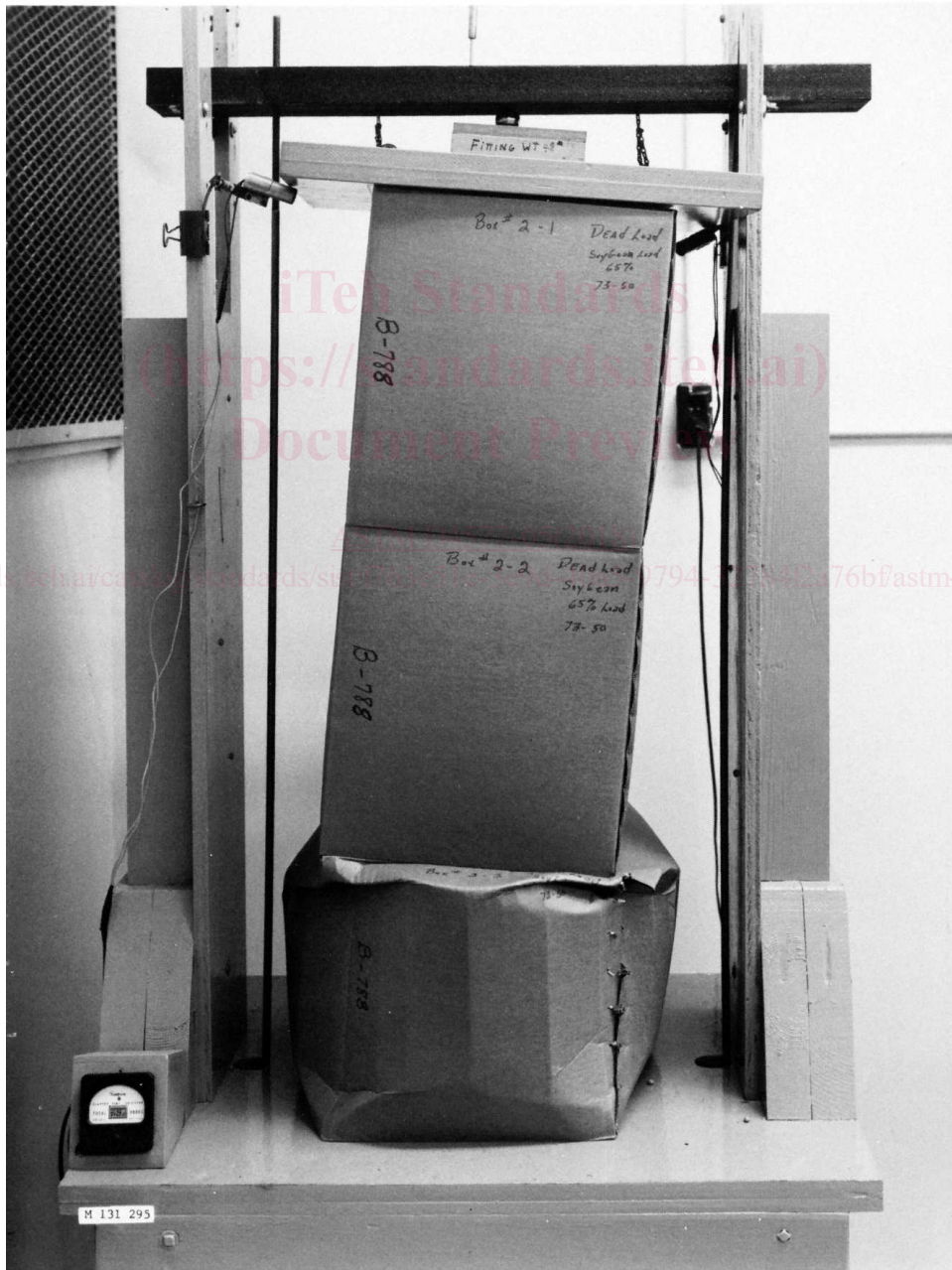
FIG. 1 Containers Under Constant Load of Dead Weights Imposed by Other Containers

5.1 The testing apparatus shall be capable of imposing a constant load on the test specimen and may be hydraulically, pneumatically, or mechanically activated. A test apparatus employing dead weights to impose the constant load may be used, as in Fig. 1 and Fig. 2. Compression machines may also be used, as in Fig. 3 and Fig. 4, and shall contain two platens, or suitable framework and fixturing, one stationary and one movable in the vertical direction. The movable platen may be swiveled (floating) or fixed and should have proper mechanical, pneumatic, or hydraulic linkages to permit top-to-bottom loading. If the floor where the test is to be conducted is subject to severe vibration, it may be necessary to vibration-isolate the test apparatus. The test device should have a timer for measuring the period of time required to cause container failure and means such as a dial indicator to measure box deformation (inches or millimetres) while under load, or an autographic recording device that records load and deformation over a period of time.