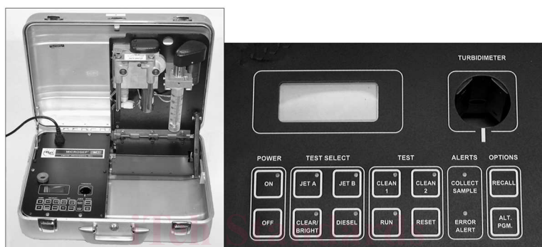
FIG. 2 Micro-Separometer Mark X and Associated Control Panel

6.2.6.2 The START pushbutton, when depressed initially, initiates the CLEAN cycle causing the syringe drive mechanism to travel to the UP position and the emulsifier motor to operate for the cleaning operation.