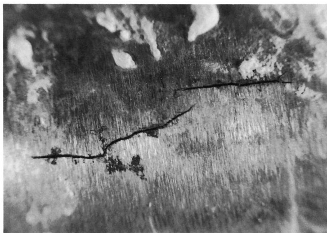
FIG. 2 Typical External Stress Corrosion Cracks (5x Magnification)