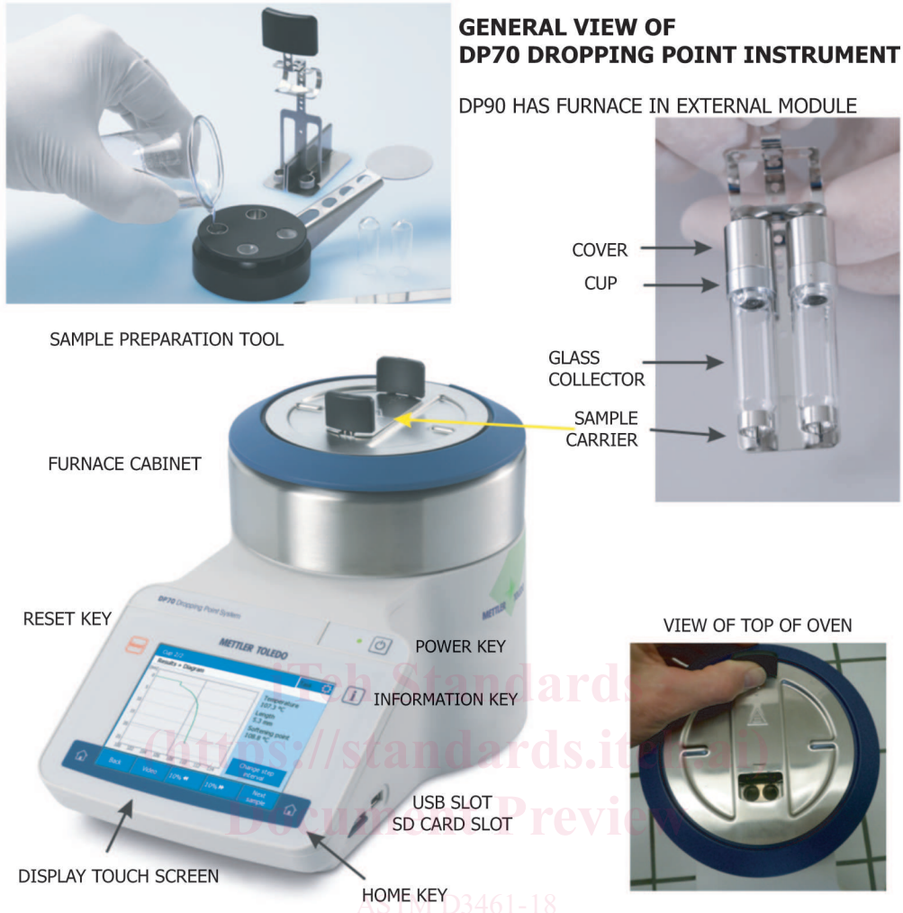
FIG. 2 General View of the METTLER TOLEDO DP70

https://standards.iteh.ai/catalog/standards/sist/244740a5-0c74-4074-9707-01bc1dcabf4d/astm-d3461-18