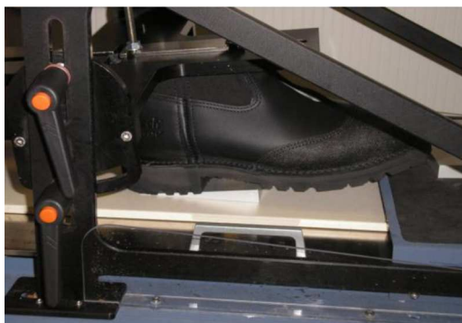
FIG. 1 Example of Footwear Mounted Using 7° Wedge to Set Proper Contact Angle

6.9 A means of sliding the test surface relative to the footwear, sole unit, top lift, or slider at a speed of 0.3 \pm 0.03 m/s commencing within 0.2 s after a vertical load of 50 N is achieved. Sliding shall not start until full vertical force is achieved, see Fig. 2 . The footwear test specimen may be constrained while the test floor is moved relative to it, or vice versa.