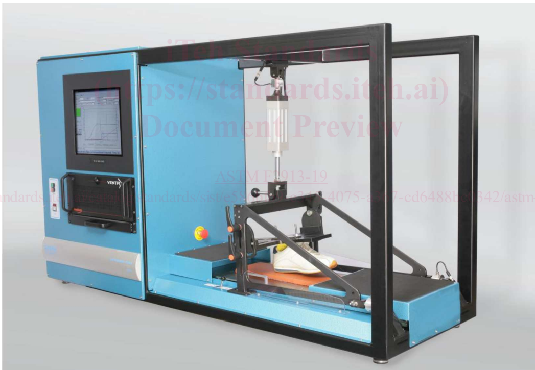
FIG. 3 Example of Test Apparatus