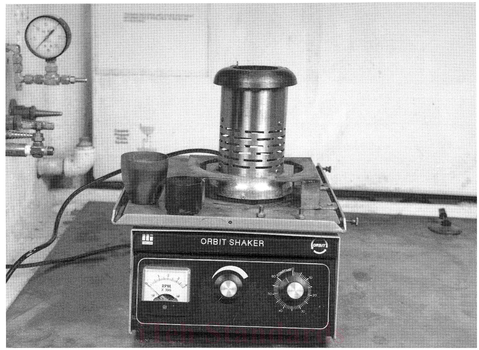
FIG. 1 Electric Bunsen Burner Mounted on the Orbital Shaker

wire basket made from the noncorrosive wire is also fabricated so that smaller size crucibles (55 mL zirconium) that pass through the heat shield are supported evenly in the heating mandrel of the electric Bunsen burner. Fig. 1 shows the electric Bunsen burner