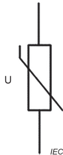
Figure 2 – Symbol for MOV

Figure 2 and Figure 3 represent the IEC 60617 symbols for MOV and thermally protected MOV, respectively.