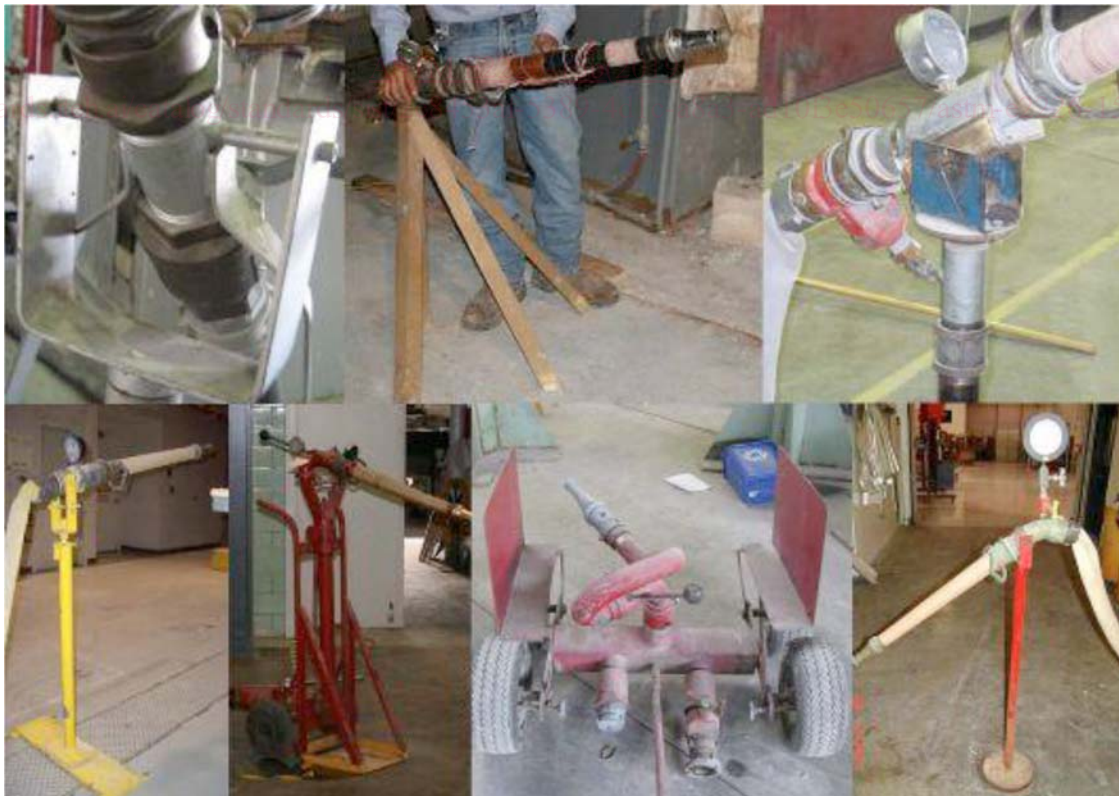
FIG. 2 Typical Hose Mounting Methods

8.3.3 Position the tip of the nozzle at the specified distance from the center of the test assembly.