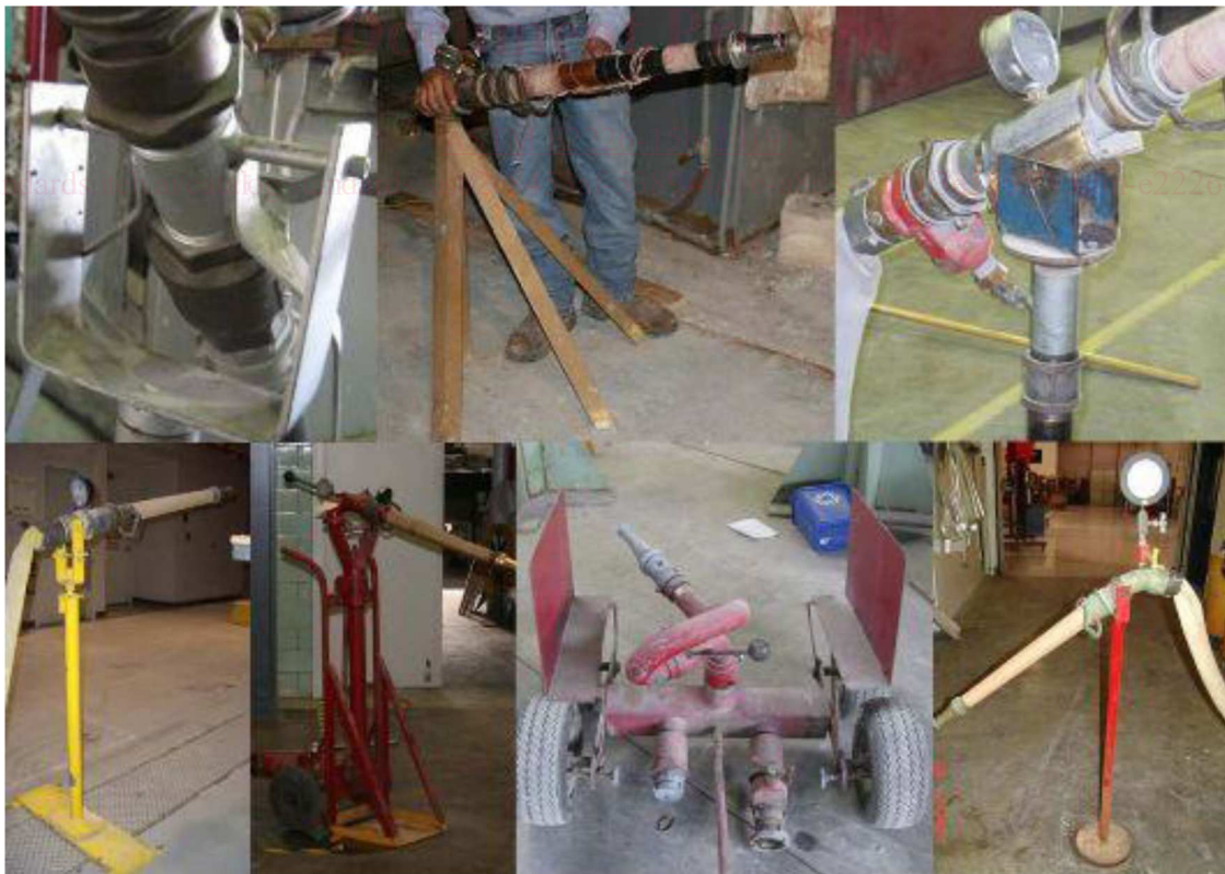
FIG. 2 Typical Hose Mounting Methods