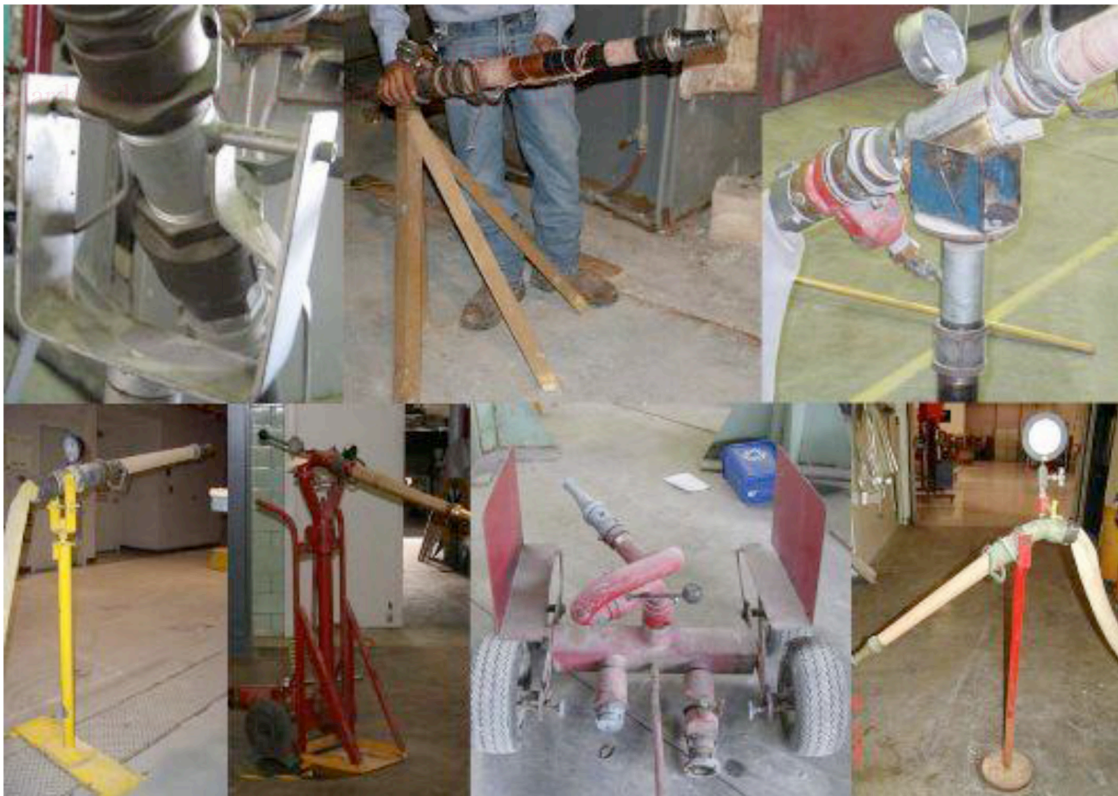
FIG. 2 Typical Hose Mounting Methods

8.3.3 Position the tip of the nozzle at the specified distance from the center of the test assembly.