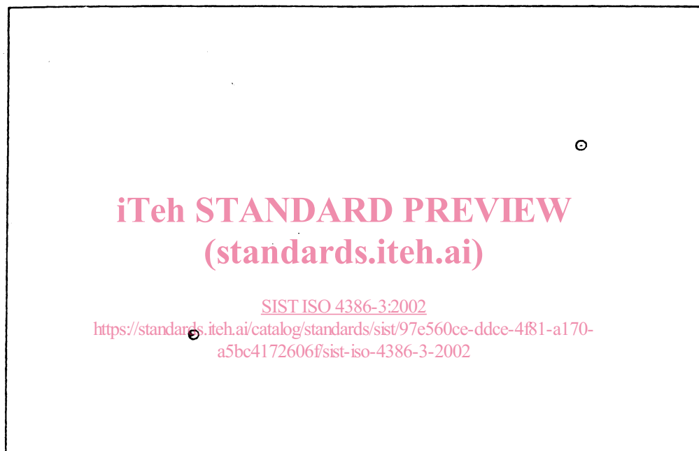
Figure A.2 — Shape and location of marks — Class A