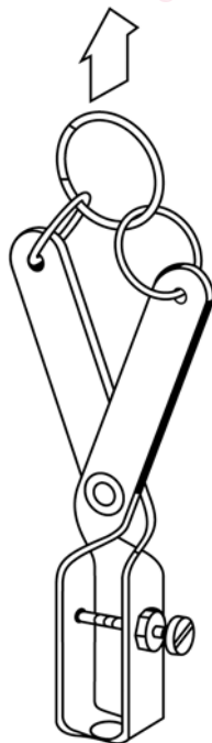
FIG. 2 Tension Test Adapter/Clamp