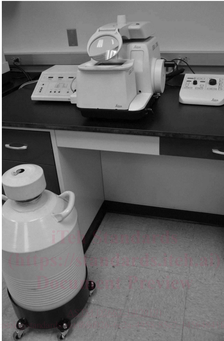
FIG. 2 Rotary Microtome with Cryogenic Attachment for Sectioning Rubber Specimens