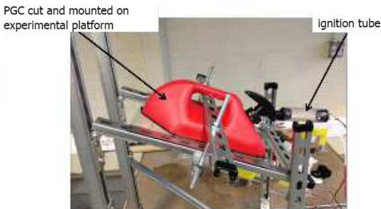
FIG. X1.1 Modified PFC Mounted on Frame and Connected to Ignition Tube

X1.1.6 The ignition tube is a transparent polycarbonate tube 120 \pm 5 mm long, with internal diameter equal to 50 \pm 5 mm (slightly larger than the open end of the pour spout) and is connected to the pour spout of the modified PFC using a tapered rubber stopper with central hole (See Fig. X1.2 for photo). The end of the ignition tube must be flush to the edge of the stopper. For spout off and separate filling opening ignition tests the internal diameter of the ignition tube is equal to the PFC opening diameter. Both setups are shown in 6.1.3.1.