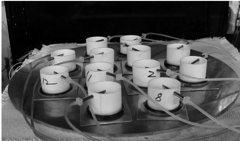
FIG. 2 Test Coupons on Hot Plate