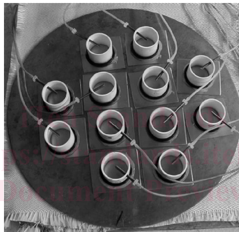
FIG. 3 Test Cells on Hot Plate

https://standards.iteh.ai/catalog/standards/sist/8a4d1a83-e83d-40c8-8c0a-a5bba15c982a/astm-c1617-19