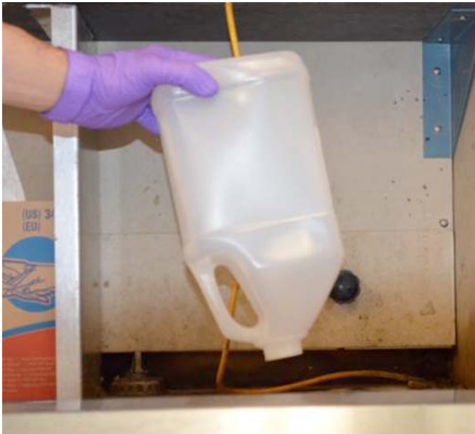
FIG. 1 Draining of Sample Container with a Spout