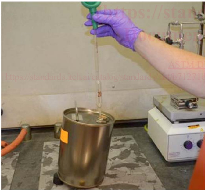
FIG. 2 Draining of Sample Container with No Spout