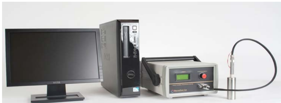
Shown are the controller connected to the platinum-wire sensor with the sensor residing in the sampling cell, along with the liquid specimen. For non-ambient temperature readings, the sampling cell inserts into a temperature control peripheral (not shown). The computer downloads data from the controller for storage and for the creation of spreadsheets and reports.