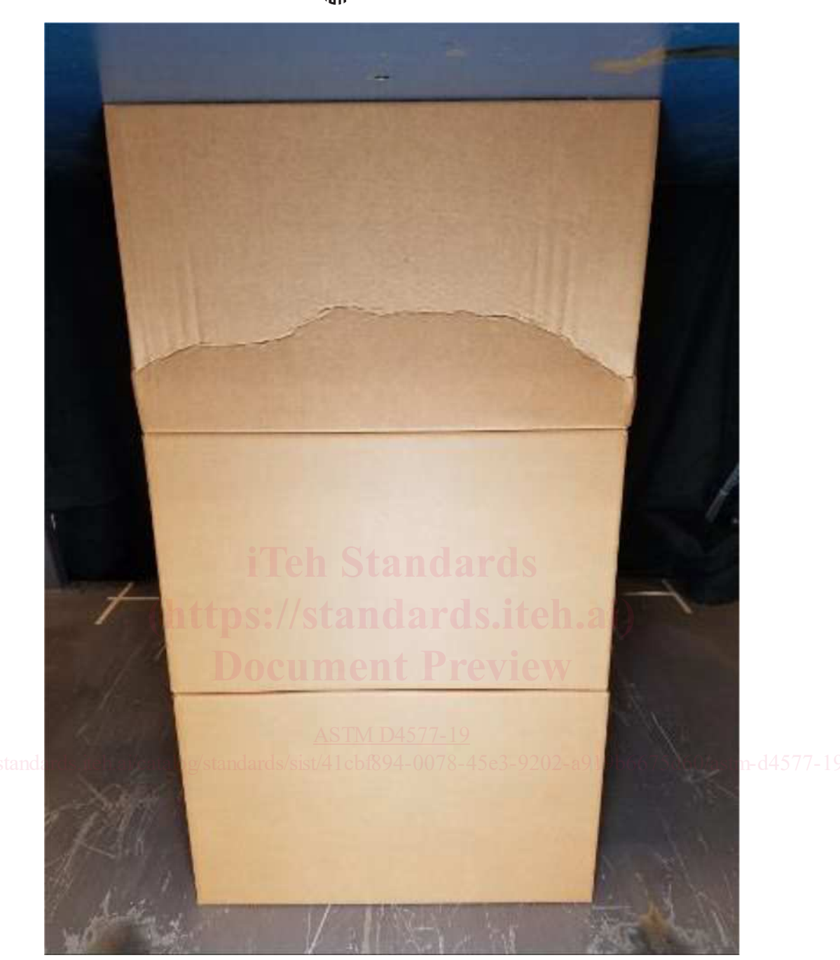
FIG. 3 ContainerContainers Under Constant Load in Compression Test Machine With Fixed Platen

6.1.2 The testing apparatus should have load arrestors or safety interlocks to prevent complete crushing of the container after initial failure.