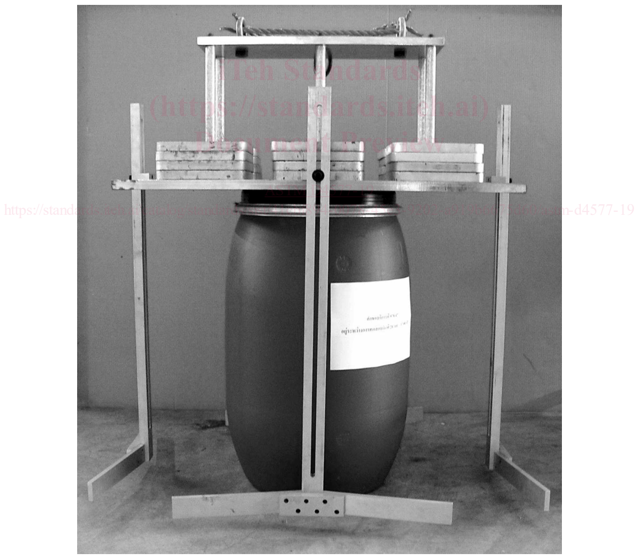
FIG. 2 Container Under Constant Load of Dead Weights

6.1 Performance of a test should never be considered without regard to safety. Some apparent precautions against injuries are: 6.1.1 Care and caution should be observed while placing the shipping container filled or unfilled on the testing apparatus.