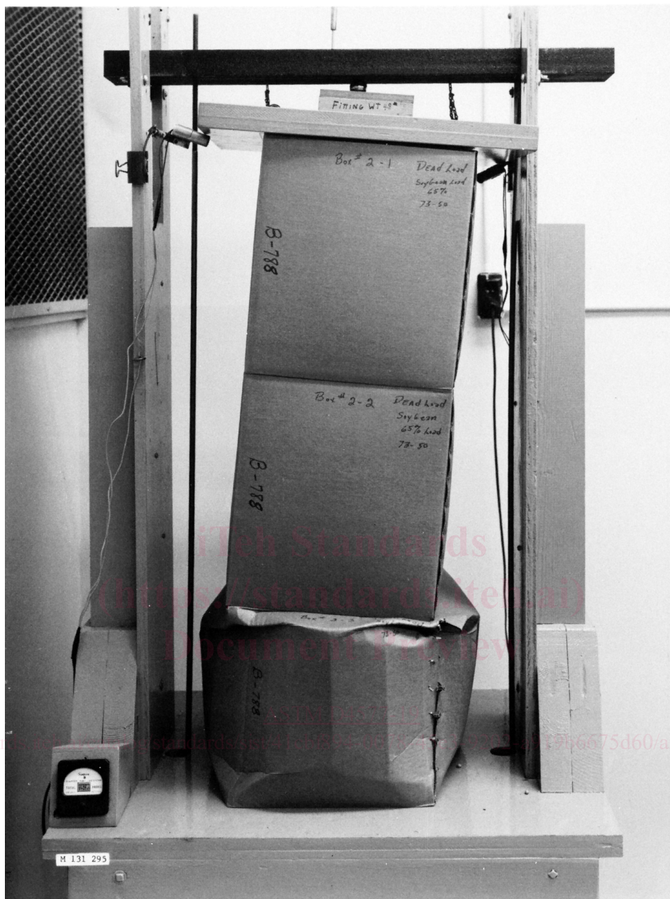
FIG. 1 Containers Under Constant Load of Dead Weights Imposed by Other Containers

for measuring the period of time required to cause container failure and means such as a dial indicator to measure box deformation (inches or millimetres) while under load, or an autographic recording device that records load and deformation over a period of time.