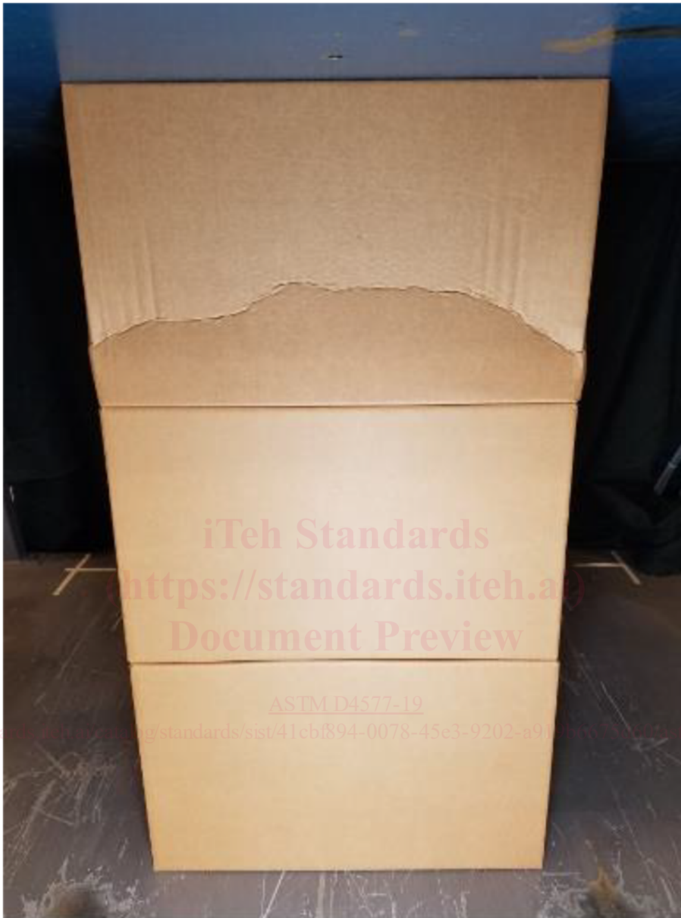
FIG. 3 Containers Under Constant Load in Compression Test Machine With Fixed Platen

9.2 The test container shall be preconditioned in the desired atmosphere for such a time as is necessary to bring the container into equilibrium with that atmosphere and using the techniques given in Practice D685.