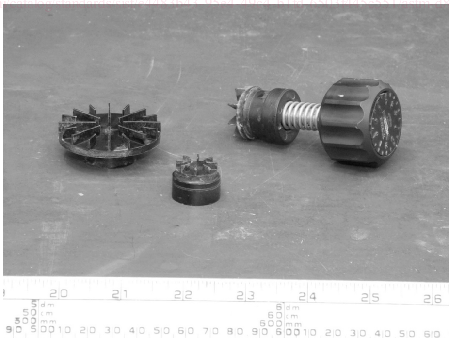
FIG. 1 Example of a Typical Torsional Shear Device with Standard (mid-size) Vane Attached, Along with Smaller and Larger Sized Vanes

6.1 Torsional Shear Device —A mechanical device consisting of a calibrated torque spring attached to a measuring scale and outfitted with one or multiple interchangeable vanes. Fig. 1 shows an example of a typical torsional shear device with standard (mid-size) vane attached, along with a smaller and a larger sized vane. Fig. 2 is a schematic of the torsional shear device.