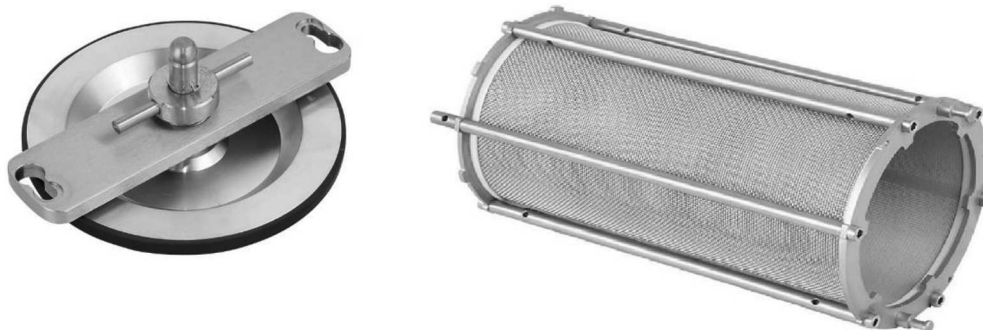
FIG. 2 Washing Drum with Lid, to be Filled with Asphalt Mixture Prior to Extraction (Fits into Washing Chamber in Lid Fig. 1, #1)

6.2.1 Tetrachloroethylene , reagent grade at initial filling. This solvent type must maintain solvent alkalinity above 7 ppm NaOH equivalent and pH value above 7.2. The solvent alkalinity and pH shall be verified once per week or at an interval selected at the discretion of the user based on machine usage and material type, or per manufacturer recommendations.