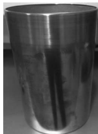
FIG. 3 Centrifuge Cup with Inlay Paper

5.7 Balance , readable to 0.1 g and capable of measuring the mass of specimen and container. The balance shall conform to the requirement of Guide D4753, Class GP2.