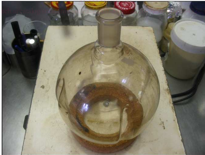
FIG. 3 Two-Liter Morton Flask on Cork Ring

NOTE 4—The recommended flask for this test is a 2-L Morton flask, also referred to as a modified German rolling flask; see Fig. 3. The 2-L Morton flask is recommended because there is a fair amount of foaming when the emulsified asphalt is above 100 °C and under vacuum. As can be seen in Fig. 3, the Morton flask has indentations arranged at 90° intervals around the flask perimeter. These indentations facilitate agitation of the emulsified asphalt during the vacuum distillation procedure. A standard pear-shaped rotary evaporator flask would not provide the same level of agitation and is therefore not recommended. The bath must be of sufficient volume and depth such that the Morton flask can be submerged in the bath liquid so that the full volume of emulsified asphalt when fluid is below the surface of the bath oil when the flask is not being rotated. 3 A food-grade mineral oil with a nominal viscosity of 350 cs at 60 °C (140 °F) has been found acceptable as a bath fluid. The rotary evaporator bath manufacturer for the specific conditions of this test may recommend other bath fluids. The rotary evaporator condenser can be cooled by tap water or by using a closed-system circulating chiller to ensure condensation of water vapor from the vacuum distillation procedure.