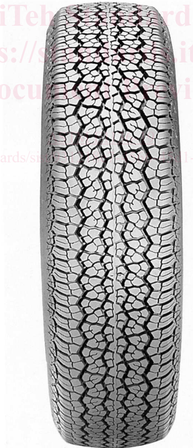
FIG. 1 Front View of the P195/75R14 Radial Standard Reference Test Tire

4.2 The tire shall be designed to conform with the Tire and Rim Association, Inc. (TRA) standard nominal dimensions and tolerances for cross section and overall diameter found in the current Year Book. 4