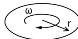
FIG. 2 A Schematic Representation of a Spinning Disk

(1) This function is the same as that for the parallel plate cell shown in Eq 2. The highest wall shear stress in this configuration will be in the vicinity of the entrance port. A consequence of this will be that cells detached by the highest wall shear stress may influence detachment of cells in the lower wall stress zone. Unlike the parallel plate laminar flow chamber, cells tested in the radial flow chamber will be subject to a complex biaxial stress field.