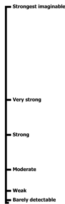
FIG. 2 Labeled Magnitude Scale