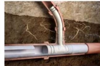
FIG. 3 SMHG O-Rings on Lateral Tube and Main Sheet