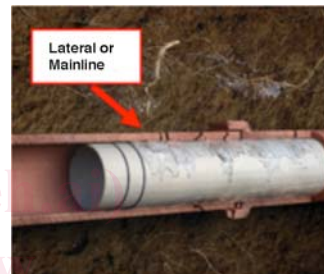
FIG. 4 SMHG O-Rings on Main Sheet

is designed to attach to liner used to abandon non-active sewer service laterals to form a robust seal.