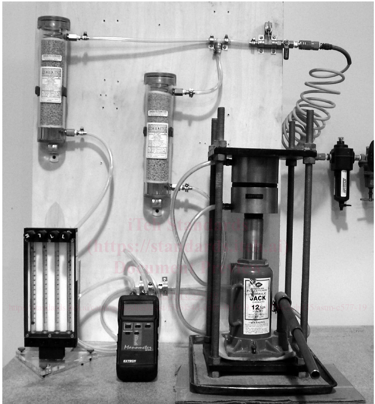
FIG. 1 Permeability Apparatus