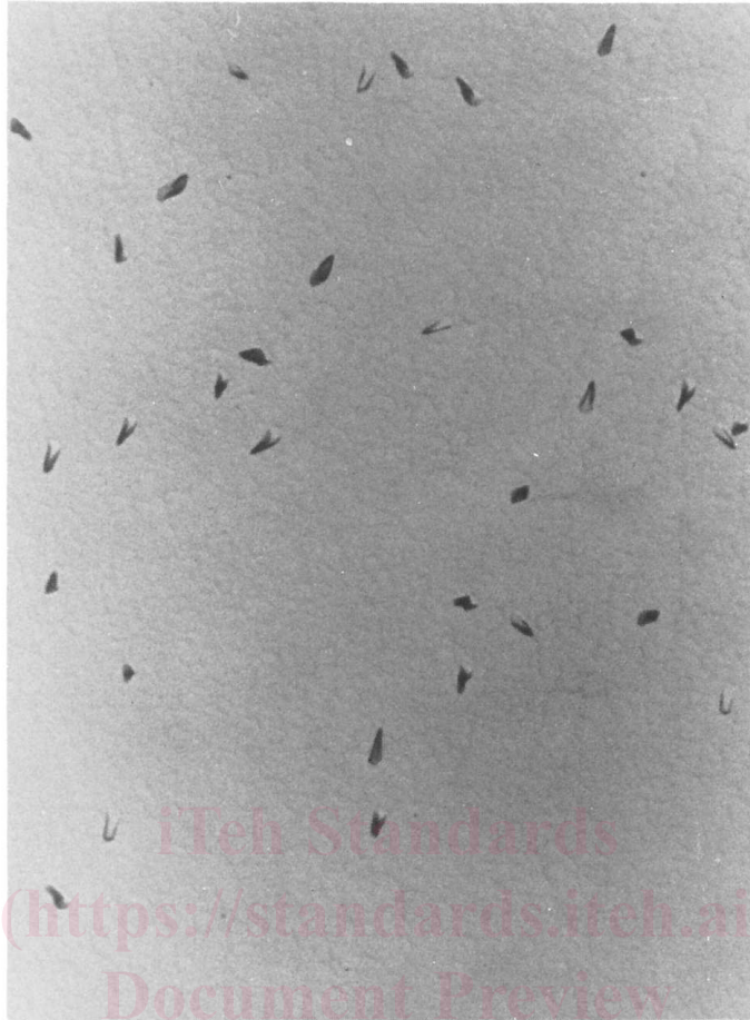
FIG. 2 Quartz Crystal (001 Plane) (continued)