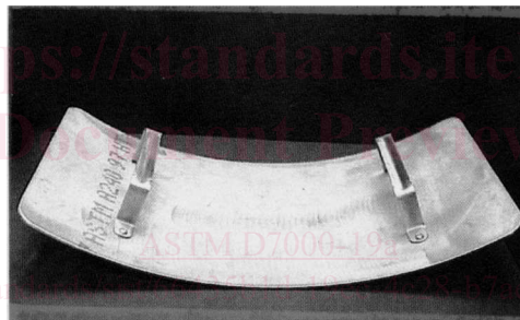
FIG. 2 Sweep Test Compactor

6.2 Aggregates —The job aggregates should be sampled and split according to Practice D75/D75M. They shall be placed in an oven and dried to a constant weight. The aggregates shall be dry sieved to obtain a test sample that has 100 % passing the 9.5-mm sieve and <1 % passing the 4.75-mm sieve. The amount of aggregate used for each specimen shall be in accordance to the equation below and can be seen by the example in Table 1. The aggregate amount shall be interpolated between values when necessary, and with a tolerance of ±1 %.