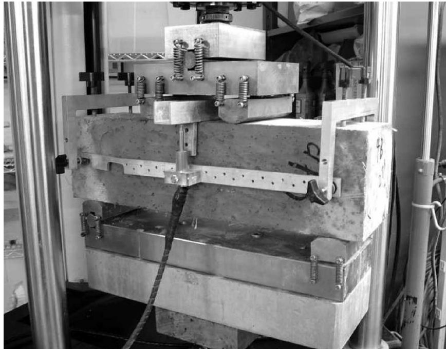
FIG. 2 Arrangement to Obtain Net Deflection by Using Two Transducers Mounted on Jig Secured to Specimen Directly Above Supports

or analog devices mounted on the jig at mid-span, one on each side, measure deflection through contact with appropriate brackets attached to the specimen. The average of the measurements represents the net deflection.