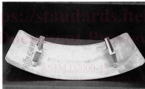
FIG. 2 Sweep Test Compactor

6.2 Aggregates —The job aggregates should be sampled and split according to Practice D75D75/D75M . They shall be placed in an oven and dried to a constant weight. The aggregates shall be dry sieved to obtain a test sample that has 100 % passing the 9.5-mm sieve and <1 % passing the 4.75-mm sieve. The amount of aggregate used for each specimen shall be in accordance to the equation below and can be seen by the example in Table 1 . The aggregate amount shall be interpolated between values when necessary, and with a tolerance of \pm 1 %.