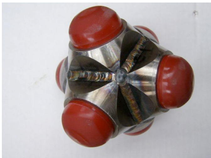
FIG. 3 8.4 lb Commercial Hexapod Tumbler