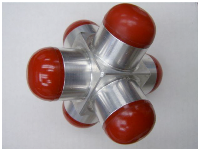
FIG. 4 2.8 lb Residential Hexapod Tumbler

6.2 Specimen Backing Sheet , polyethylene approximately 375 by 8.5 by 0.08 in. (approximately 950 by 215 by 2 mm).