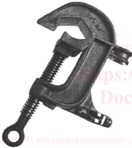
FIG. 2 Style II "C" Shape Clamp