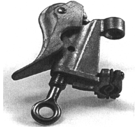
FIG. 3 Style II Duck Bill Shape Clamp