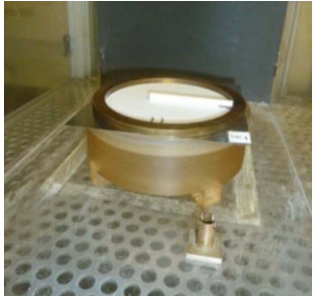
FIG. 4 Close-up of a Test Cigarette on the Stainless Steel/Paper Substrate

7.7 Cigarette Ignition System —A system consisting of an air draw component and an ignition source shall be used to ignite the test cigarettes. The cigarette shall be supported in a