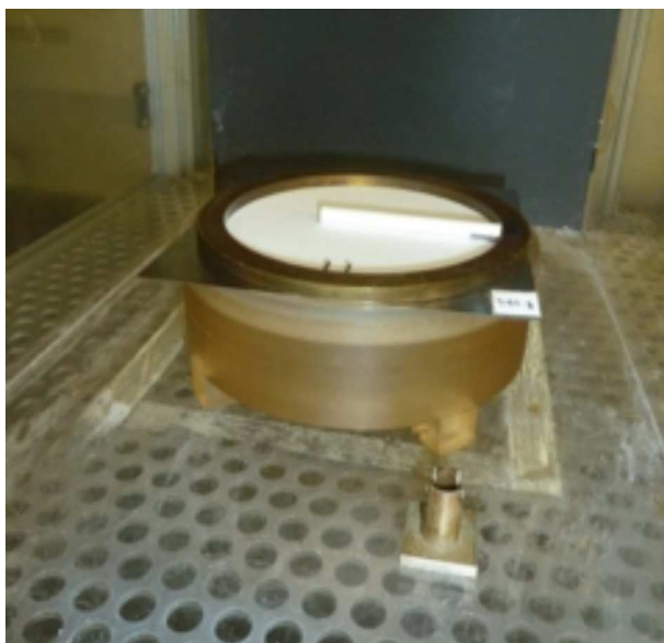
FIG. 4 Close-up of a Test Cigarette on the Stainless Steel/Paper Substrate

7.6 Cigarette Holder —A holder shall be used to support the lit cigarette in a horizontal position in the test chamber prior to placement of the cigarette onto the filter paper substrate. The holder shall not clamp the cigarette nor stress it in any other manner, nor shall it contact the cigarette within a nominal 30 mm (1.2 in.) of its lit end.