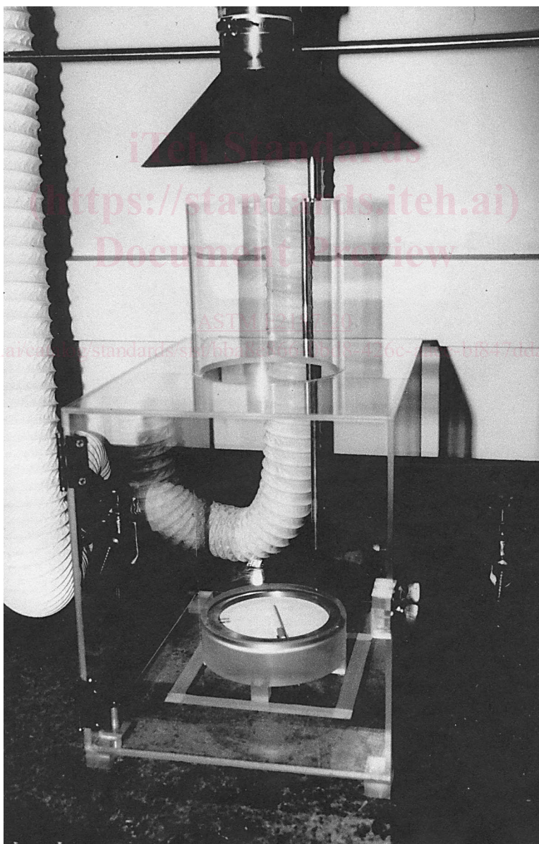
FIG. 1 Photograph of Test Chamber and Holder for the Filter Paper Substrates

7.4.1 A cylindrical support, shown in Fig. 2, shall be made of PMMA or similarly rigid material, dimensioned as follows. The outer diameter shall be 165 \pm 1 mm ( 6.50 \pm 0.04 in.), the inner diameter shall be 127 \pm 1 mm ( 5.00 \pm 0.04 in.), and the height