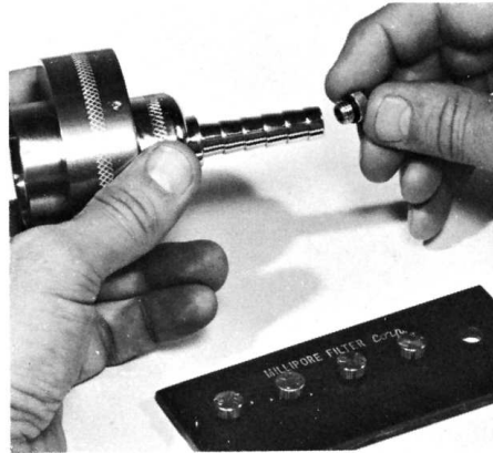
FIG. 4 Inserting a Typical Orifice