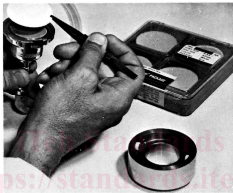
FIG. 5 Placing the Filter on a Typical Screen Support

9.5 Apply vacuum at the predetermined flow rate of 14 L/min [0.5 cfm] for a period of 1 min for each area. Sample required areas (Fig. 3) by repeating 9.2.