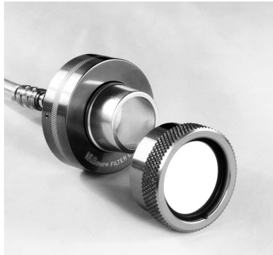
FIG. 1 Filter Assembly