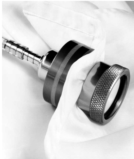
FIG. 2 Adapter

6.6 Programmable Image Analyzer, a Computer-Driven Microscope Which Counts and Sizes Particles With Automated Stage and Automated Focus Interface: