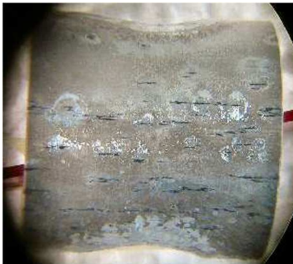
FIG. 2 Photograph Showing Example of Lined-up Pitting on C-ring Specimen

10.3.1 A specimen that reveals intergranular cracking, even when accompanied by transgranular cracking, shall be considered as an SCC failure. Intergranular fissures that are no deeper than the width of localized areas of intergranular corrosion or, in the case of C-rings, not deeper than those in unstressed or compressively stressed surfaces, shall not be considered as an SCC failure : failure (see Fig. 3) . In the case of tension specimens, the depth of intergranular fissures may be compared to those in an unstressed specimen when available.