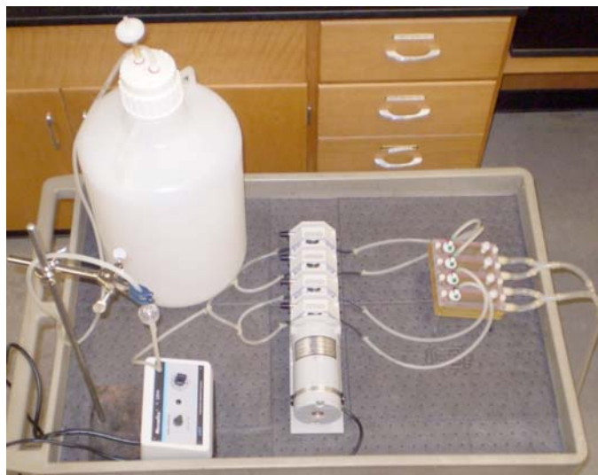
FIG. 2 Drip Flow Reactor Laboratory Set-Up in Continuous Flow Operation